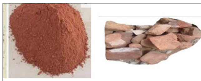
Fig 1: Waste Clay Bricks

Waste clay bricks were obtained from local dumpsites in Bayelsa State. These bricks were crushed and pulverized into fine powder, as illustrated in Figure 1.