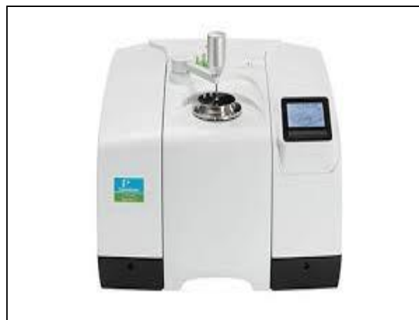
Fig 1: Perkin Elmer Fourier transform infrared spectrometer

Perkin Elmer Fourier transform infrared spectrometer with deuterated triglycin sulphate (DTGS) as a detector is used for the analysis. The liquid sample is placed between two KBr pellets with the help of capillary tube. Each pellet is made of 0.2mm thickness and it is placed in the path of the sample beam. The spectra are recorded from 4000 to 450 \text{cm}^{-1} , the number of scans being 256 at a resolution of 4 \text{cm}^{-1} . Scan speed is 0.20 \text{cm/s} .